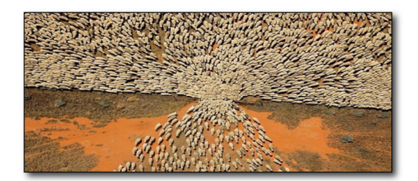
"Brenda Station"

The people could not see that the law/ Torah they cursed was designed to bring them life. God/Elohim allows a test to build courage and faith in the hearts of men. Courage is not imparted, it must be learned. Overcoming worldly ways that lead to destruction will enable God's/Elohim truth to strengthen and empower believers to walk out their salvation (eternity). Sadly few find its path.